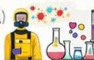
Chemical & Biological Hazards