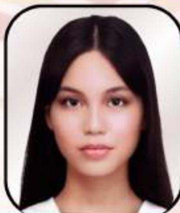
Princess Shrine Mabanta GAS Representative