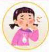
Coughing or sneezing (droplets)