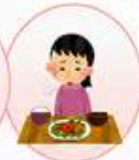
Loss of appetite