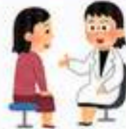
Seek medical advice.