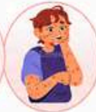
Itchy red spots/blisters