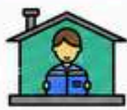
Stay home if symptoms appear.