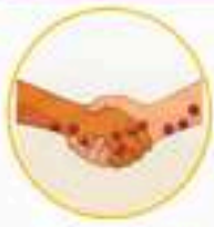
Direct contact with blisters or fluid